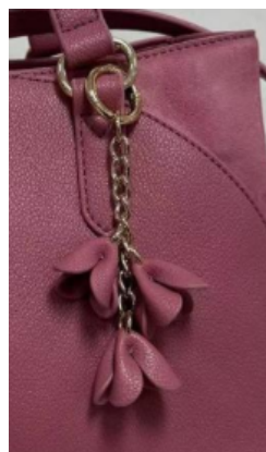
DECORATIVE Hinge Ring/Not Secure