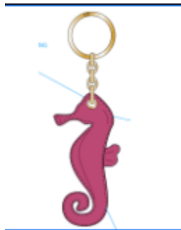
FUNCTION Key Chain w/Split Ring (Multi)