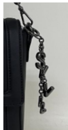
DECORATIVE Hinge Ring/Not Secure