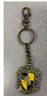
FUNCTION Key Chain w/Split Ring (Multi)