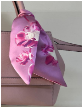
FUNCTION Scarf (Multi)