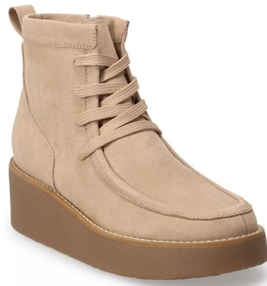
Step into style with these Sonoma Goods For Life Enigma women's ankle boots.

Sonoma Goods For Life® Enigma Women's Ankle Boots