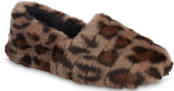
Isotoner Shay Faux Fur Women's Slippers

The following is a snapshot of the attributes that are typically required for slipper copy approvals. This not an exhaustive list and is subject to change. For attribute definitions, visit the Attribute Glossary