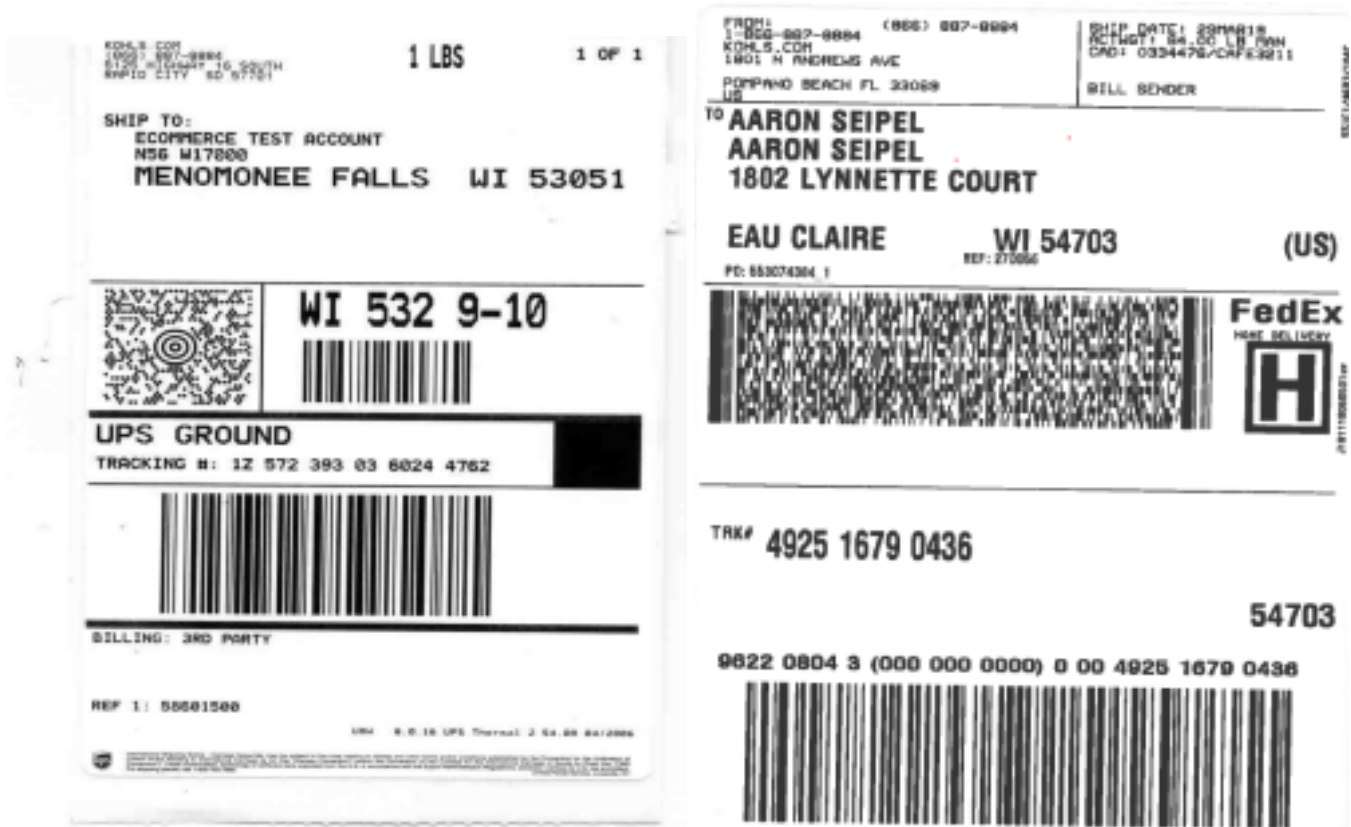
Figure 2: UPS & FedEx Sample Ship Labels