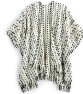
ALT3 - laydown (required)