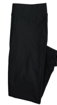
ALT 2 - laydown (required)