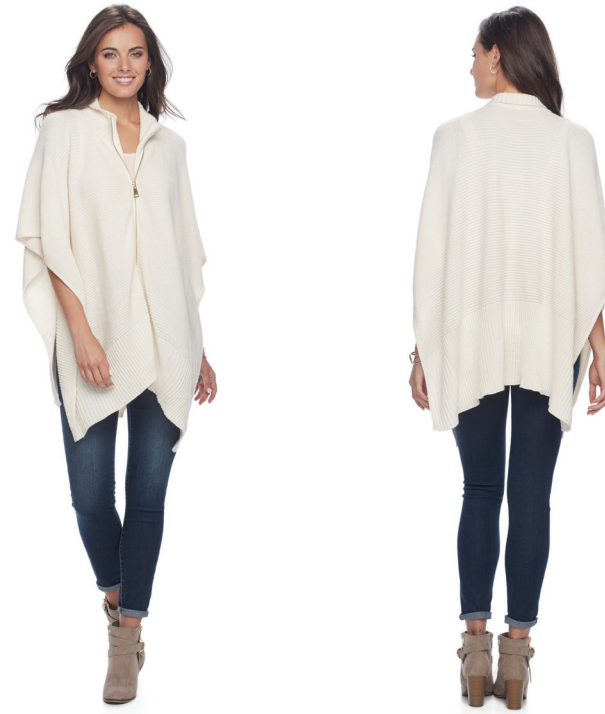
ALT - back view (required)