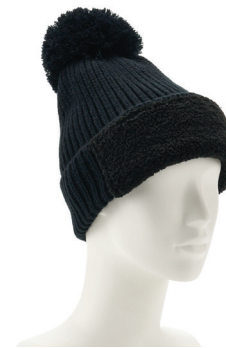
required on form/on model