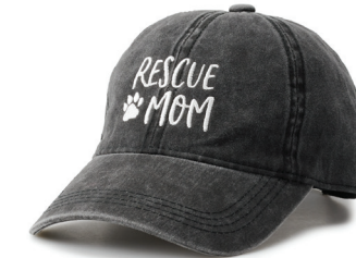
tabletop - front