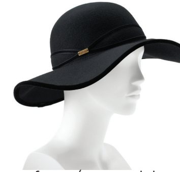
on form / on model