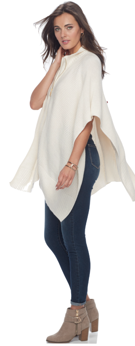
ALT2 - side view (recommended)