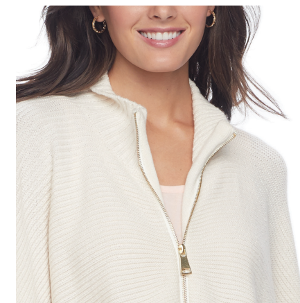
ALT5 - detail view (recommended)

- Please follow the Alt cadence shown here. If there are any additional Alts needed for special garment details, please number sequentially beginning with next Alt.