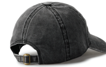
tabletop - back