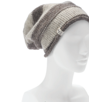
on form / on model