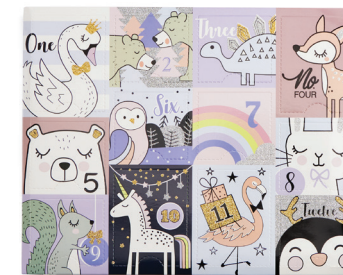
front of box