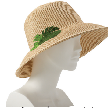
on form / on model