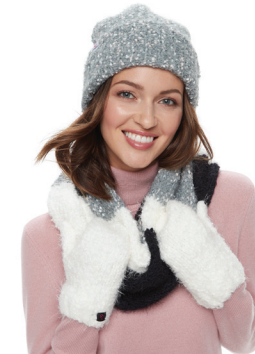
recommended on model